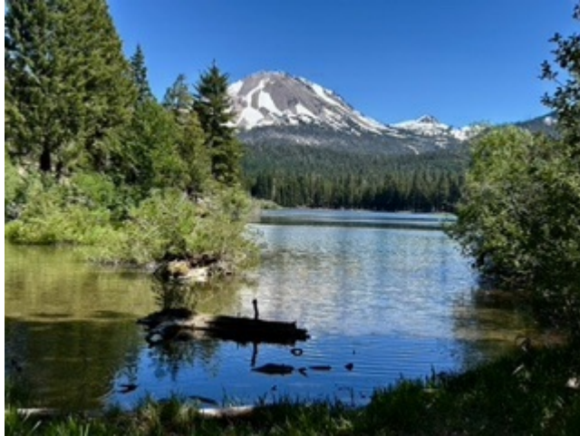
Manzanita Lake, Mt. Lassen Nat'l Park, California