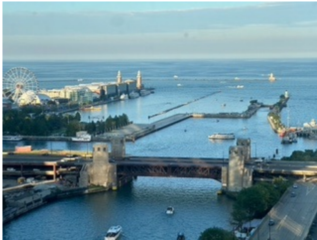
Well, they're back now, but this was taken from their hotel room, a view of where the Chicago River meets Lake Michigan.